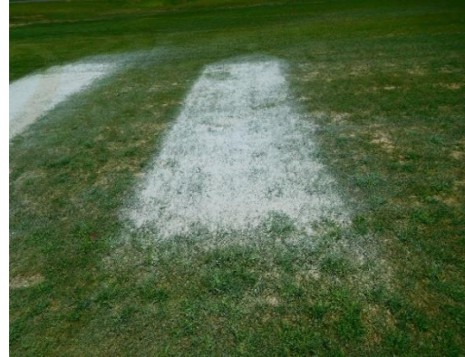
Overlay P03 (9Lx once)