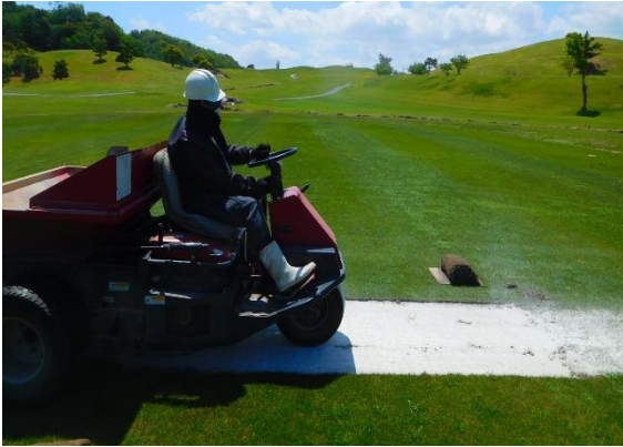
(1) By overlaying machine, overlay PA on the ground