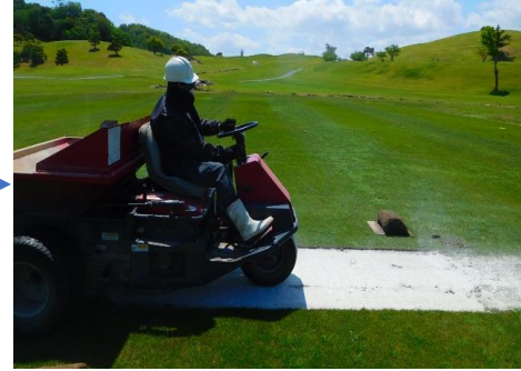
(1) Peel grass off the ground by machine and hand (3mm of thick)