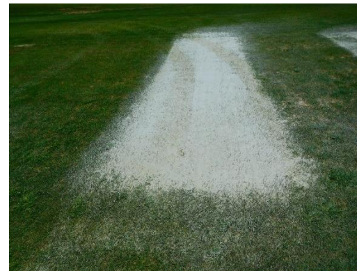
Overlay P03 (18Lx once)