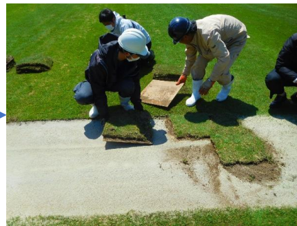
(4) Put back the grass peeled off